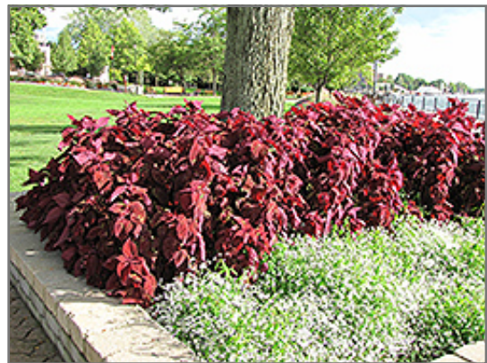
ColorBlaze Rediculous Coleus

Ann Arbor 734-332-7900 155 N. Maple at Jackson