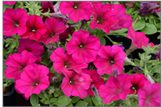
Wave Carmine Velour Petunia flowers

Wave Carmine Velour Petunia is a dense herbaceous annual with a ground-hugging habit of growth. Its medium texture blends into the garden, but can always be balanced by a couple of finer or coarser plants for an effective composition.