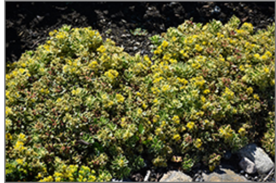
Rock 'N Low Boogie Woogie Stonecrop in bloom