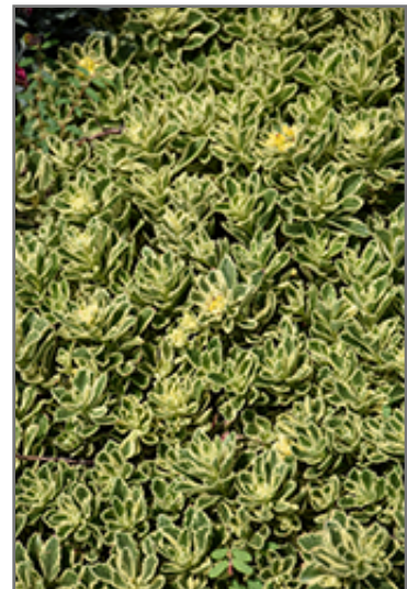
Rock 'N Low Boogie Woogie Stonecrop

Ann Arbor 734-332-7900 155 N. Maple at Jackson