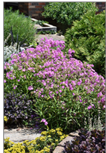
Opening Act Ultrapink Phlox in bloom