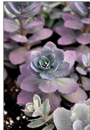
Plum Dazzled Stonecrop foliage