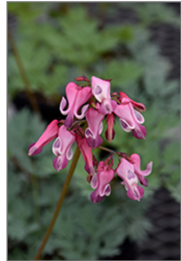
Pink Diamonds Fern-leaved Bleeding Heart flowers

Pink Diamonds Fern-leaved Bleeding Heart is a fine choice for the garden, but it is also a good selection for planting in outdoor pots and containers. It is often used as a 'filler' in the 'spiller-thriller-filler' container combination, providing a mass of flowers and foliage against which the thriller plants stand out. Note that when growing plants in outdoor containers and baskets, they may require more frequent waterings than they would in the yard or garden.