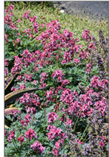
Pink Diamonds Fern-leaved Bleeding Heart flowers

Pink Diamonds Fern-leaved Bleeding Heart is an herbaceous perennial with a mounded form. It brings an extremely fine and delicate texture to the garden composition and should be used to full effect.