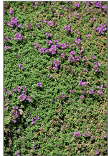
Creeping Thyme in bloom

Creeping Thyme is recommended for the following landscape applications;