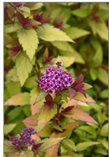
Poprocks Rainbow Fizz Spirea flowers

Ann Arbor 734-332-7900 155 N. Maple at Jackson