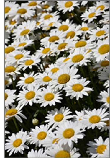
Becky Shasta Daisy flowers