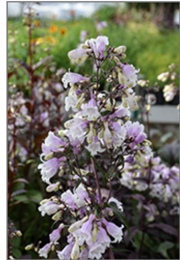
Pocahontas Beard Tongue flowers

This is a relatively low maintenance plant, and is best cleaned up in early spring before it resumes active growth for the season. It is a good choice for attracting butterflies to your yard. It has no significant negative characteristics.