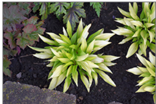
Munchkin Fire Hosta

Ann Arbor 734-332-7900 155 N. Maple at Jackson