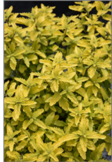
Sunshine Blue II Caryopteris foliage

Sunshine Blue II Caryopteris makes a fine choice for the outdoor landscape, but it is also well-suited for use in outdoor pots and containers. With its upright habit of growth, it is best suited for use as a 'thriller' in the 'spiller-thriller-filler' container combination; plant it near the center of the pot, surrounded by smaller plants and those that spill over the edges. It is even sizeable enough that it can be grown alone in a suitable container. Note that when grown in a container, it may not perform exactly as indicated on the tag - this is to be expected. Also note that when growing plants in outdoor containers and baskets, they may require more frequent waterings than they would in the yard or garden.