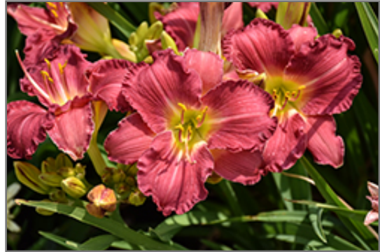
Happy Ever Appster Romantic Returns Daylily flowers

Happy Ever Appster Romantic Returns Daylily is recommended for the following landscape applications;