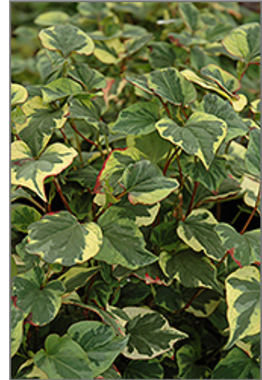
Variegated Chameleon Plant foliage