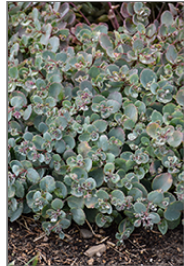
Rock 'N Grow Superstar Stonecrop foliage

Rock 'N Grow Superstar Stonecrop is a fine choice for the garden, but it is also a good selection for planting in outdoor pots and containers. It is often used as a 'filler' in the 'spiller-thriller-filler' container combination, providing a mass of flowers and foliage against which the thriller plants stand out. Note that when growing plants in outdoor containers and baskets, they may require more frequent waterings than they would in the yard or garden.