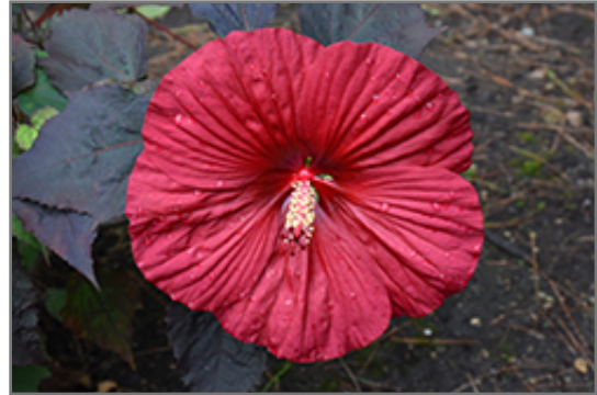
Summerific Holy Grail Hibiscus flowers

Summerific Holy Grail Hibiscus is an herbaceous perennial with an upright spreading habit of growth. Its relatively coarse texture can be used to stand it apart from other garden plants with finer foliage.