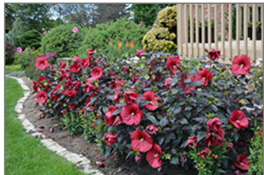
Summerific Holy Grail Hibiscus in bloom