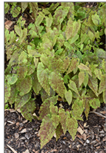
Amber Queen Barrenwort foliage