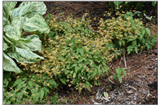
Amber Queen Barrenwort in bloom