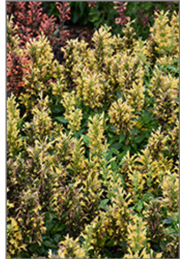
Poquito Butter Yellow Hyssop flowers

Poquito Butter Yellow Hyssop is recommended for the following landscape applications;