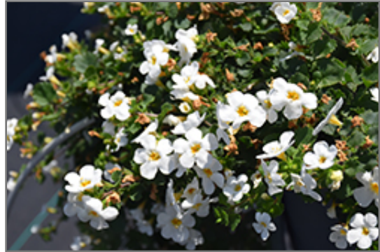
Snowstorm Snow Globe Bacopa flowers

Snowstorm Snow Globe Bacopa is recommended for the following landscape applications;