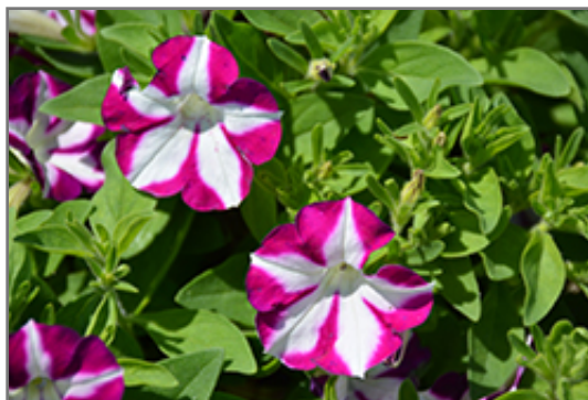
Blanket Rose Star Petunia flowers

Blanket Rose Star Petunia is recommended for the following landscape applications;