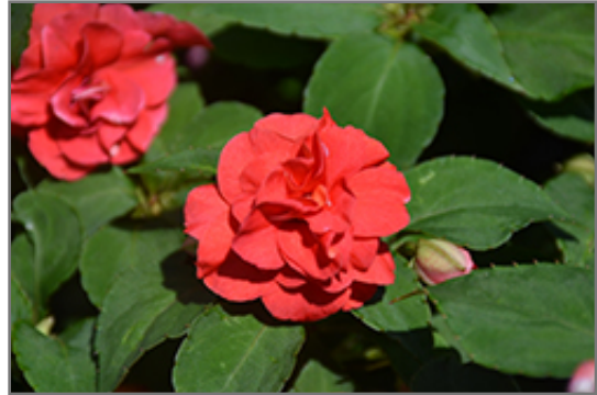
Rockapulco Red Impatiens flowers

Rockapulco Red Impatiens is recommended for the following landscape applications;