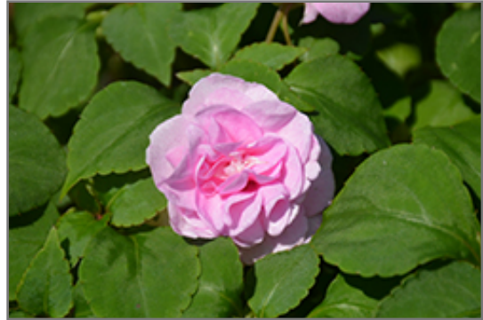
Rockapulco Orchid Impatiens flowers

Rockapulco Orchid Impatiens is recommended for the following landscape applications;