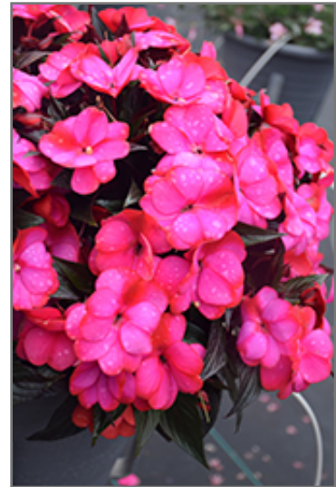
Infinity Blushing Lilac New Guinea Impatiens flowers

Infinity Blushing Lilac New Guinea Impatiens is recommended for the following landscape applications;