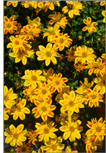
Beedance Red Stripe Bidens flowers

Beedance Red Stripe Bidens is recommended for the following landscape applications;