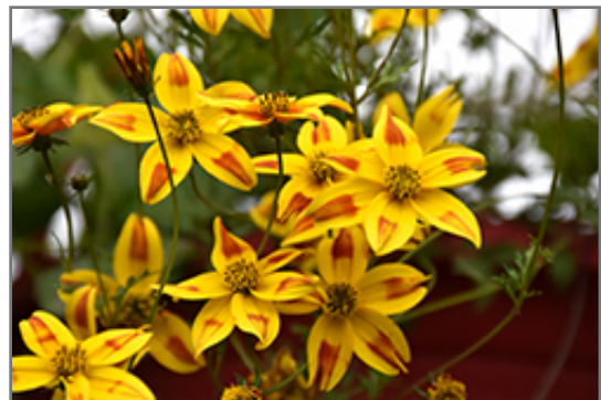
Beedance Red Stripe Bidens flowers

Ann Arbor 734-332-7900 155 N. Maple at Jackson