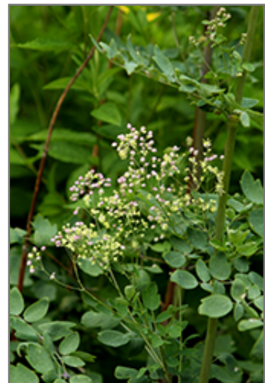
Elin Meadow Rue flowers

Ann Arbor 734-332-7900 155 N. Maple at Jackson