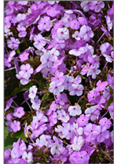
Fashionably Early Princess Garden Phlox flowers