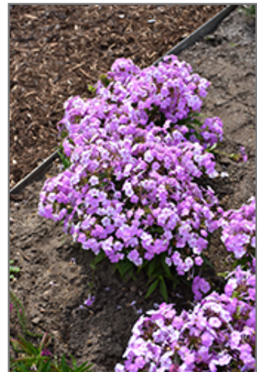
Fashionably Early Princess Garden Phlox in bloom