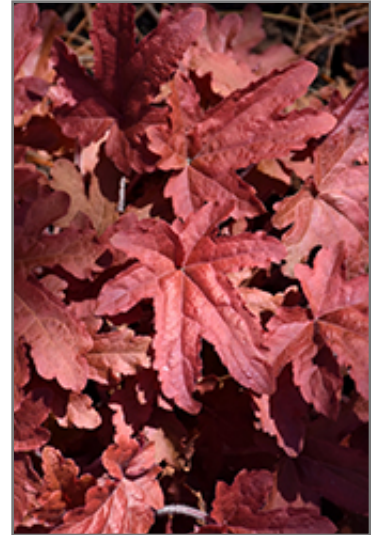
Fun and Games Red Rover Foamy Bells foliage

This is a relatively low maintenance plant, and should be cut back in late fall in preparation for winter. It is a good choice for attracting hummingbirds to your yard. It has no significant negative characteristics.