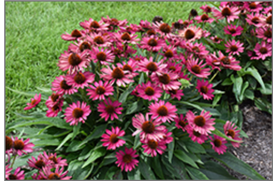
Kismet Raspberry Coneflower in bloom

Kismet Raspberry Coneflower will grow to be about 16 inches tall at maturity, with a spread of 24 inches. Its foliage tends to remain dense right to the ground, not requiring facer plants in front. It grows at a fast rate, and under ideal conditions can be expected to live for approximately 10 years. As an herbaceous perennial, this plant will usually die back to the crown each winter, and will regrow from the base each spring. Be careful not to disturb the crown in late winter when it may not be readily seen!