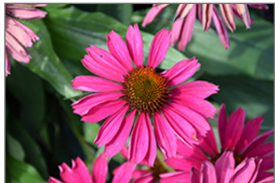
Kismet Raspberry Coneflower flowers