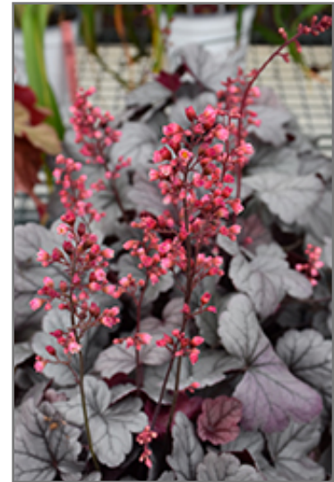
Dolce Silver Gumdrop Coral Bells flowers

This is a relatively low maintenance plant, and should be cut back in late fall in preparation for winter. It is a good choice for attracting hummingbirds to your yard. It has no significant negative characteristics.