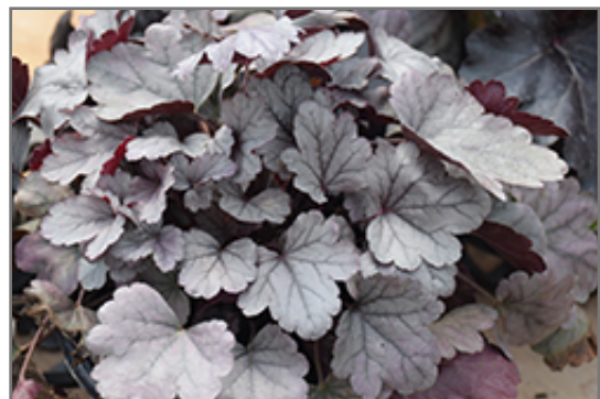
Dolce Silver Gumdrop Coral Bells foliage