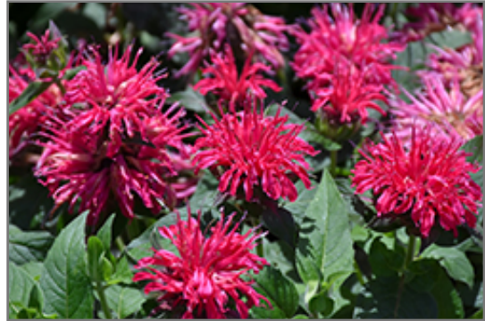
Balmy Rose Beebalm flowers