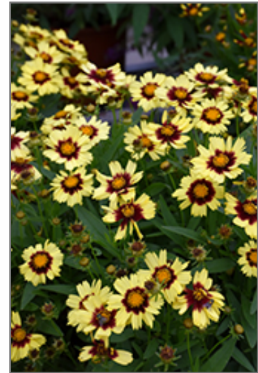
UpTick Yellow and Red Tickseed flowers

UpTick Yellow and Red Tickseed is a fine choice for the garden, but it is also a good selection for planting in outdoor pots and containers. It is often used as a 'filler' in the 'spiller-thriller-filler' container combination, providing a mass of flowers against which the thriller plants stand out. Note that when growing plants in outdoor containers and baskets, they may require more frequent waterings than they would in the yard or garden.