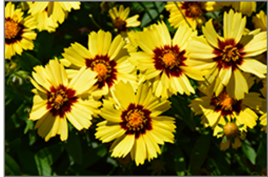
UpTick Yellow and Red Tickseed flowers

This is a relatively low maintenance plant, and is best cleaned up in early spring before it resumes active growth for the season. It is a good choice for attracting bees and butterflies to your yard, but is not particularly attractive to deer who tend to leave it alone in favor of tastier treats. It has no significant negative characteristics.