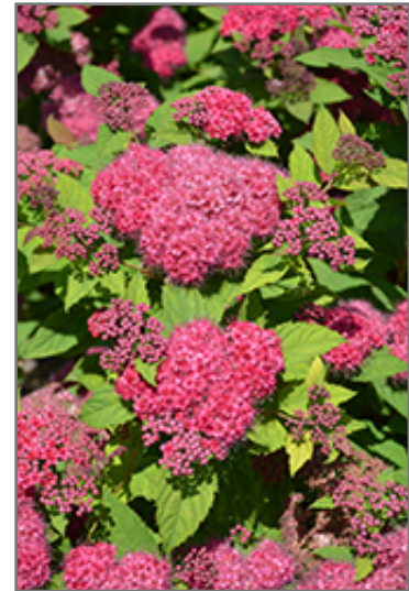
Double Play Red Spirea flowers

This shrub will require occasional maintenance and upkeep, and is best pruned in late winter once the threat of extreme cold has passed. It is a good choice for attracting butterflies to your yard, but is not particularly attractive to deer who tend to leave it alone in favor of tastier treats. It has no significant negative characteristics.