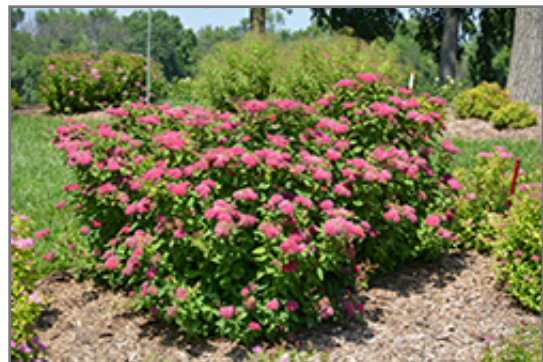
Double Play Red Spirea in bloom