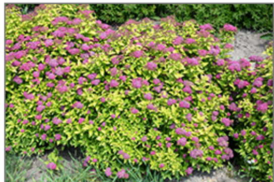
Double Play Gold Spirea in bloom