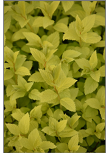
Double Play Gold Spirea foliage

This shrub should only be grown in full sunlight. It prefers to grow in average to moist conditions, and shouldn't be allowed to dry out. It is not particular as to soil type or pH. It is highly tolerant of urban pollution and will even thrive in inner city environments. This is a selected variety of a species not originally from North America.