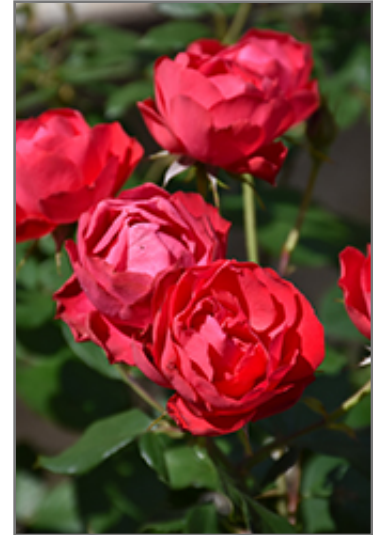
Oso Easy Double Red Rose flowers

Oso Easy Double Red Rose is recommended for the following landscape applications;