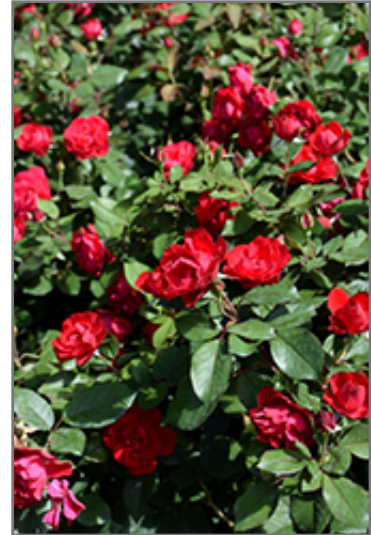
Oso Easy Double Red Rose flowers

This shrub should only be grown in full sunlight. It does best in average to evenly moist conditions, but will not tolerate standing water. It is not particular as to soil type or pH. It is somewhat tolerant of urban pollution. This particular variety is an interspecific hybrid.