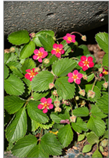
Lipstick Strawberry flowers

Lipstick Strawberry has masses of beautiful cherry red daisy flowers with yellow eyes along the stems from late spring to early summer, which are most effective when planted in groupings. Its tomentose round compound leaves remain green in color throughout the season. It features an abundance of magnificent red berries from mid spring to mid fall.