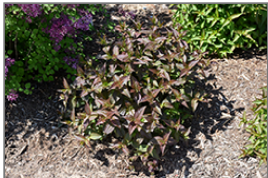
Kodiak Black Diervilla