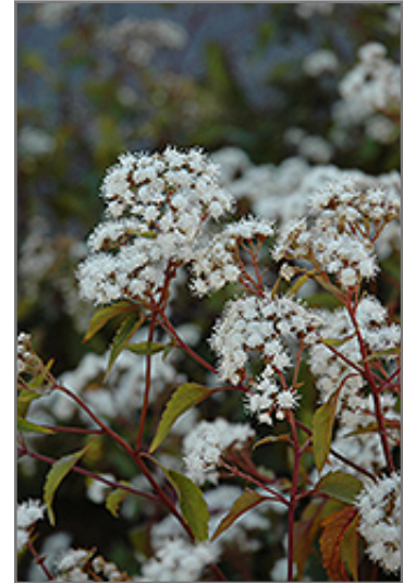
Chocolate Boneset flowers

Chocolate Boneset is recommended for the following landscape applications;