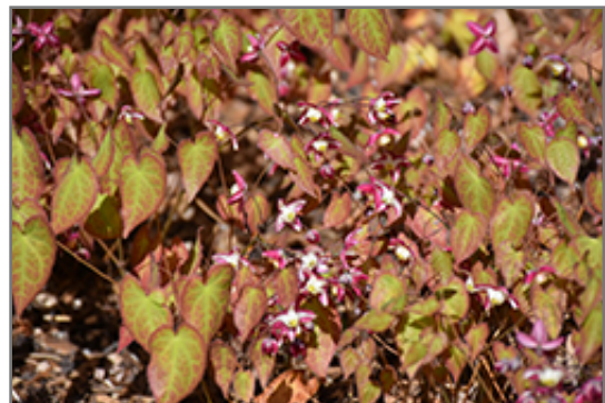
Bishop's Hat in bloom