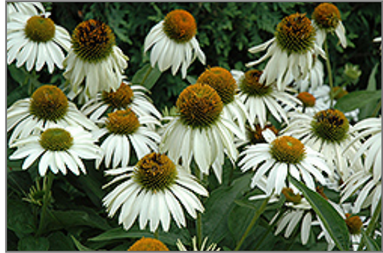
White Swan Coneflower flowers

This is a relatively low maintenance plant, and is best cleaned up in early spring before it resumes active growth for the season. It is a good choice for attracting butterflies to your yard, but is not particularly attractive to deer who tend to leave it alone in favor of tastier treats. It has no significant negative characteristics.