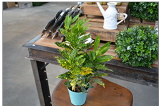
Gold Dust Variegated Croton