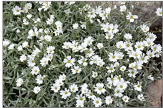
Snow-In-Summer flowers