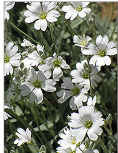
Snow-In-Summer flowers