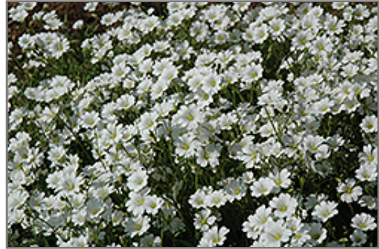
Snow-In-Summer flowers