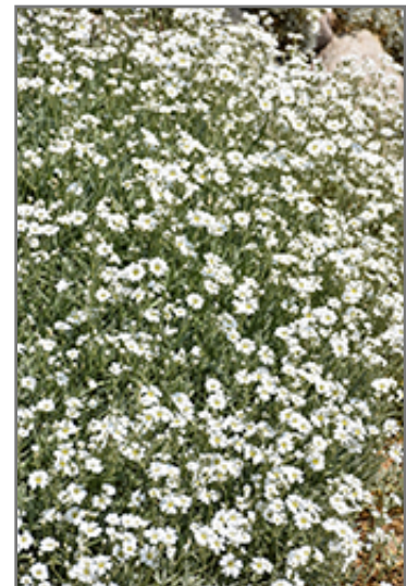
Snow-In-Summer in bloom