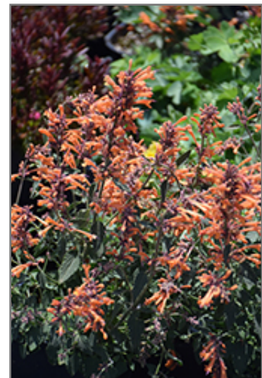
Kudos Mandarin Hyssop flowers