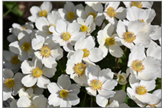
Windflower flowers