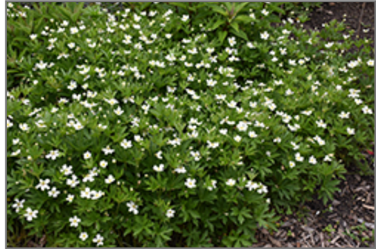
Windflower in bloom

Windflower will grow to be about 12 inches tall at maturity, with a spread of 18 inches. Its foliage tends to remain dense right to the ground, not requiring facer plants in front. It grows at a fast rate, and under ideal conditions can be expected to live for approximately 10 years. As an herbaceous perennial, this plant will usually die back to the crown each winter, and will regrow from the base each spring. Be careful not to disturb the crown in late winter when it may not be readily seen!