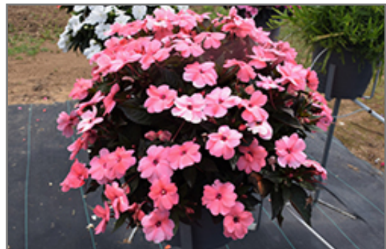
SunPatiens Compact Coral Pink New Guinea Impatiens in bloom

Ann Arbor 734-332-7900 155 N. Maple at Jackson