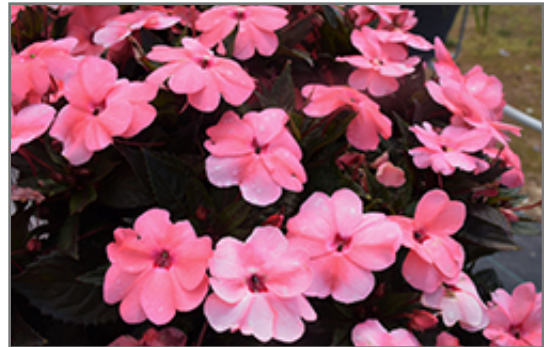
SunPatiens Compact Coral Pink New Guinea Impatiens flowers

SunPatiens Compact Coral Pink New Guinea Impatiens is a dense herbaceous annual with a mounded form. Its medium texture blends into the garden, but can always be balanced by a couple of finer or coarser plants for an effective composition.