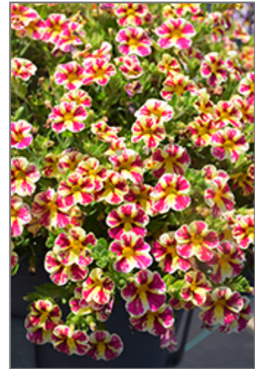
Superbells Holy Moly! Calibrachoa flowers

This plant will require occasional maintenance and upkeep. Trim off the flower heads after they fade and die to encourage more blooms late into the season. It is a good choice for attracting bees and hummingbirds to your yard, but is not particularly attractive to deer who tend to leave it alone in favor of tastier treats. It has no significant negative characteristics.