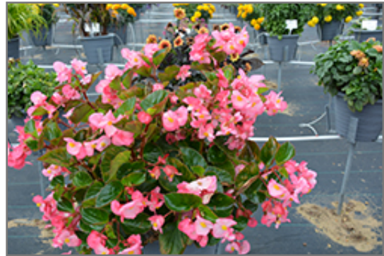
Big Pink Green Leaf Begonia in bloom