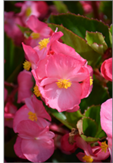
Big Pink Green Leaf Begonia flowers

This is a high maintenance plant that will require regular care and upkeep, and usually looks its best without pruning, although it will tolerate pruning. Deer don't particularly care for this plant and will usually leave it alone in favor of tastier treats. Gardeners should be aware of the following characteristic(s) that may warrant special consideration;