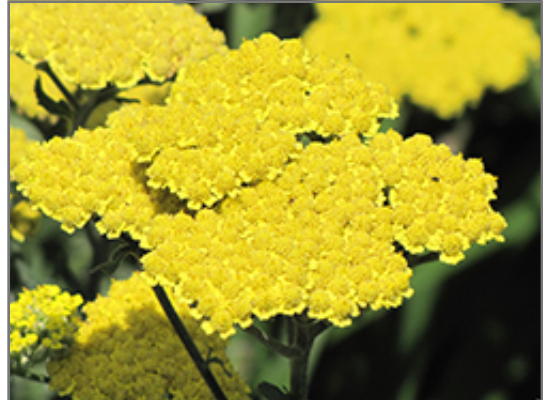
Moonshine Yarrow flowers