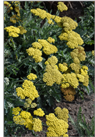
Moonshine Yarrow flowers

Moonshine Yarrow will grow to be about 24 inches tall at maturity, with a spread of 24 inches. It grows at a fast rate, and under ideal conditions can be expected to live for approximately 10 years. As an herbaceous perennial, this plant will usually die back to the crown each winter, and will regrow from the base each spring. Be careful not to disturb the crown in late winter when it may not be readily seen!