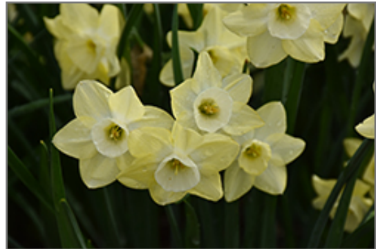
Stint Daffodil flowers