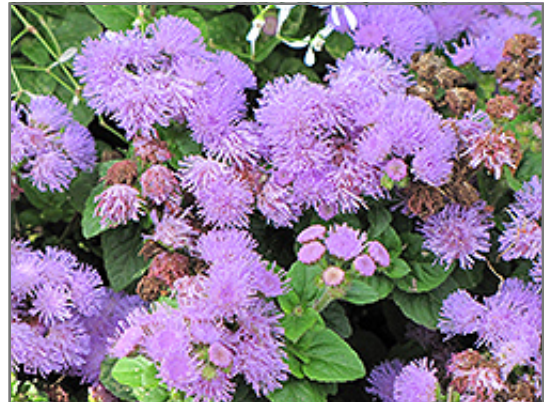
Artist Alto Blue Flossflower flowers

Artist Alto Blue Flossflower is recommended for the following landscape applications;