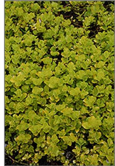
Golden Creeping Jenny foliage

Golden Creeping Jenny is recommended for the following landscape applications;